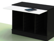
Pull-Out Desk 25mm(H) x 400mm(D) x 981mm(W) PODE001