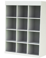
Quadrant Storage Unit 1300mm(H) x 400mm(D) x 957mm(W) QUAD001