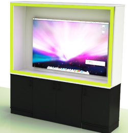
Media Unit 1300mm(H) x 500mm(D) x 2150mm(W) MEUN001