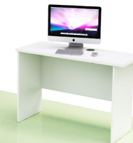
Teacher's Desk 750mm(H) x 500mm(D) x 1200mm(W) TEDE001