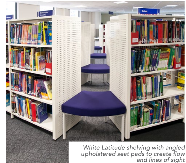
White Latitude shelving with angled upholstered seat pads to create flow and lines of sight