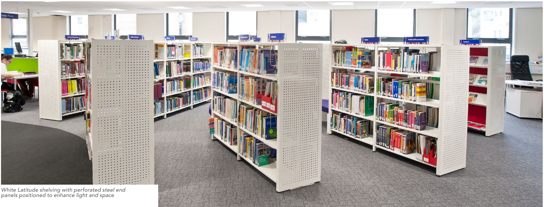
White Latitude shelving with perforated steel end panels positioned to enhance light and space