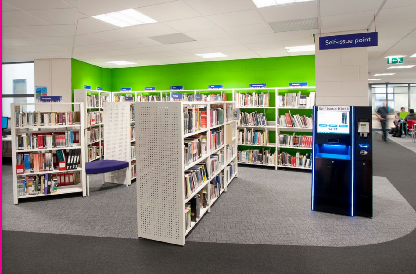
White Latitude shelving with perforated steel end panels