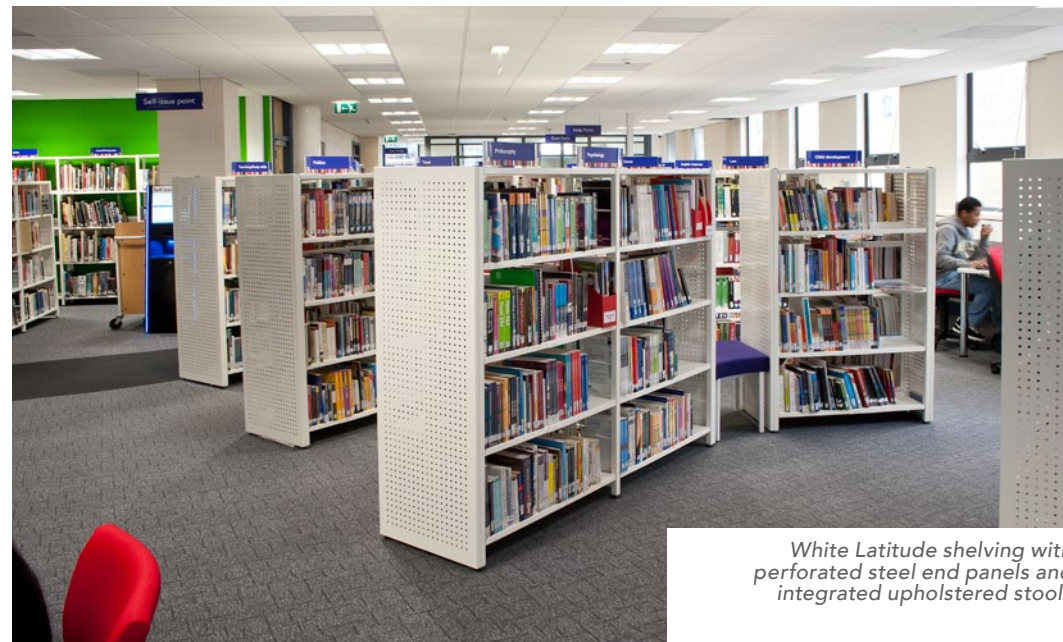
White Latitude shelving with perforated steel end panels and integrated upholstered stools