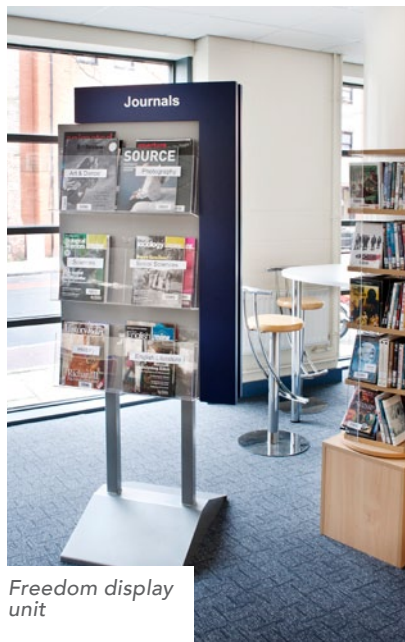
Freedom display unit